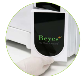
Double Hinge Door